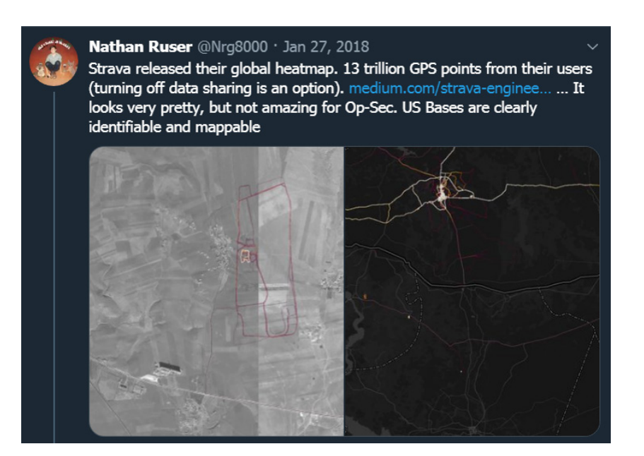
Figure 1. A screenshot of a Twitter thread by Nathan Ruser, who discovered that Starva Heat Map is revealing secretive military locations. The training routes (note unnatural pattern) are visible over satellite photographs that expose no facility at the time the photo was taken. Note: the author of the post states that the number of GPS points is wrongly 13 trillion points, while it was in fact 3 (US) billion GPS points (the number corrected in later posts) (Ruser, 2018).

After the Strava incident, the company decided to censure their most sensitive "heat maps" and military personnel were reminded not to share their activities when on duty, and especially during the deployment. It remains, however, an OPSEC issue, as many military and security personnel worldwide are still unaware of the threats to which they are exposing themselves and their institutions when sharing their data or just using their tracking devices.