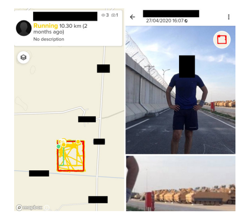
Figure 3. Screenshots of a Suunto User's training at a Turkish military base near the Syrian border. A close-up of a photo associated with his late April 2020 training allows the identification of M113 Armoured Personnel Carriers in the background (identity and location names obscured).

A second investigation case presented is of a Turkish military. The profile signed with name and surname, belongs to a soldier who used to train while being deployed to a military base in south-eastern Turkey, a dozen kilometres from Syrian border, in the spring of 2020. Later, though, around September 2020, he found himself in a Turkish military outpost near a town in northern Syria where he had been continuing his running routine depicted by post-workout pictures. Meanwhile, he had spent some time on Cyprus (July 2020) and in his wife's hometown (according to her Facebook account) in August 2020. His spring training posts from the southern Turkey base were accompanied by pictures. In some of them, one can spot military vehicles or the base facilities in the background, especially on a picture of 27<sup>th</sup> April 2020, around a dozen M113 Armoured Personnel Carriers in two rows can be identified. The User also has a Facebook profile that reveals his wife's identity and his political opinions. Such cases might be useful when gathering intelligence on Turkish army readiness and equipment at a time of Turkish intervention in Syria.